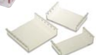
multiSUB Choice Trio includes all 3 tray sizes for optimum versatility and value

The multiSUB Choice offers a wide degree of versatility. Three tray options are available – 15 x 7cm, 15 x 10cm and 15 x 15cm – allowing the choice of one, two or all three gel length options at the time of purchase. Further purchases of additional accessories are no longer required. Maximising comb and tray options allow up to 210 samples to be resolved per gel. The 15cm total run length allows restriction fragment or other close MW sample bands to be easily separated and identified. Speed loading is accomplished using 10, 14, 16, 18, 28 and 30 sample multichannel pipette compatible combs. Fabricated multiSUB CHOICE STRETCH units are available with optional 15 x 20cm and 15 x 25cm gel trays and four 28-sample combs for those researchers wanting to perform higher resolution separation of more samples over a longer distance.